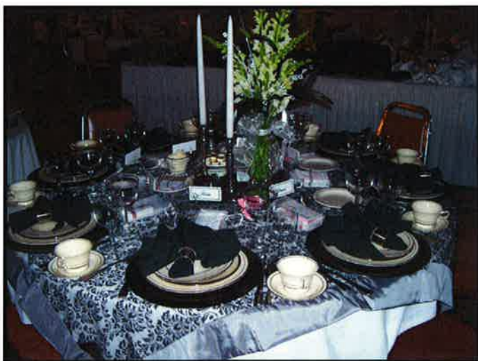
Charity Gala "V.I.P. Table"