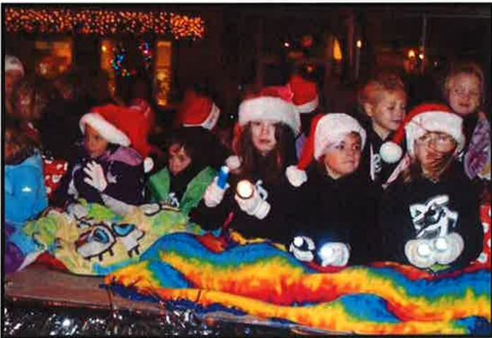
2011 Christmas Parade—"Let It Snow"

By coordinating this fundraising effort, Sunflower can be even more involved in the community.